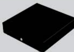
BIG metal drawer dim. 330x90x330mm