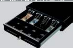
TOP metal drawer dim. 410x100x415mm