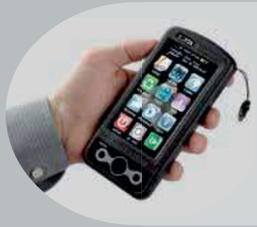
PT4 4" Palmtop

Available for Android, Windows and Linux