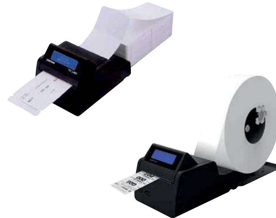
New Metal Paper Roll Holder