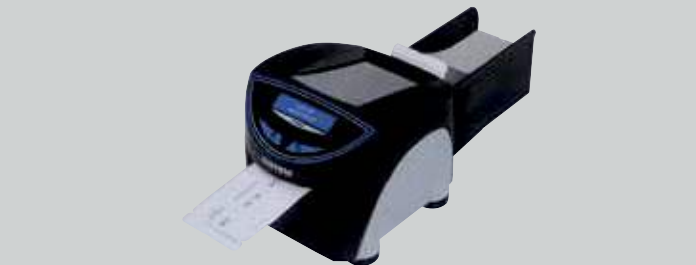
Rear ATB Drawer