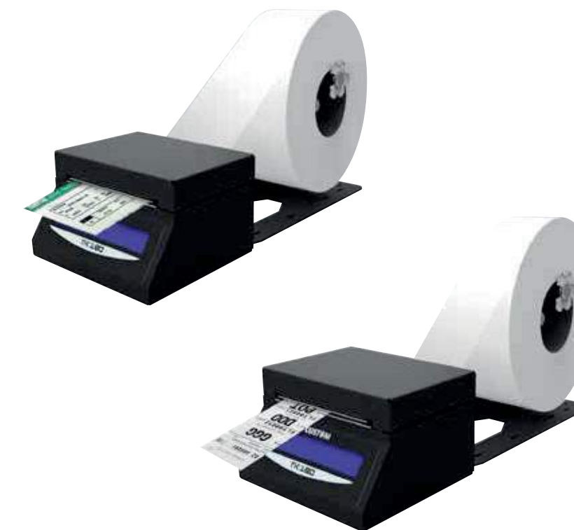
New Metal Paper Roll Holder