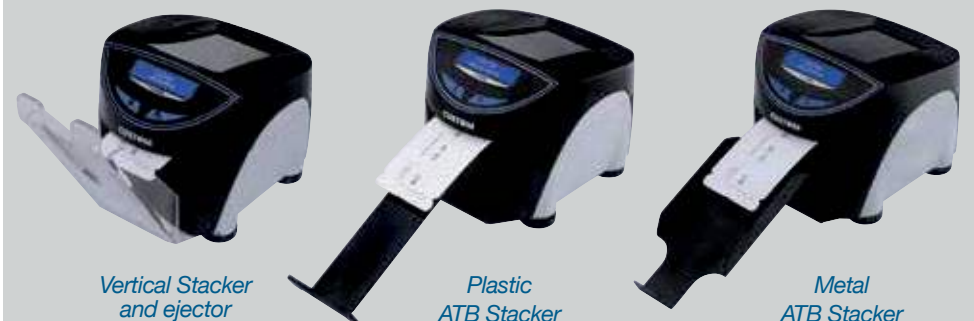
Vertical Stacker and ejector